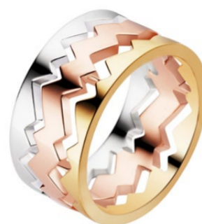
Capture Trilogy Ring white gold, pink gold, yellow gold, 18 carats

THIS SINGULAR YET UNIVERSAL COLLECTION IS INTENDED FOR WOMEN AND MEN ALIKE, INTERWEAVING THE PAST, PRESENT AND FUTURE OF A SHARED LIFE JOURNEY.