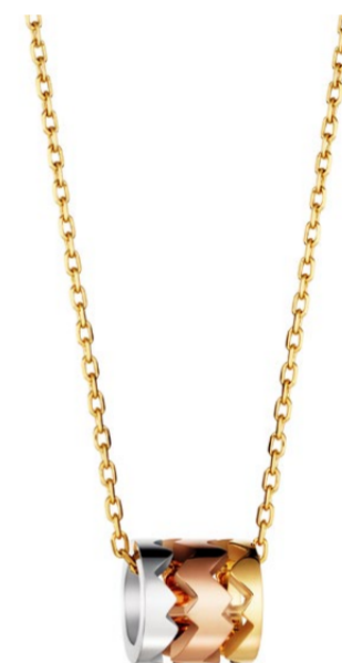
Capture Trilogy Pendant white gold, pink gold, yellow gold, 18 carats