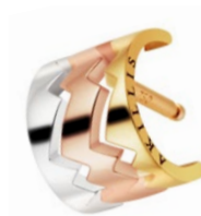
Capture Trilogy Earring white gold, pink gold, yellow gold, 18 carats