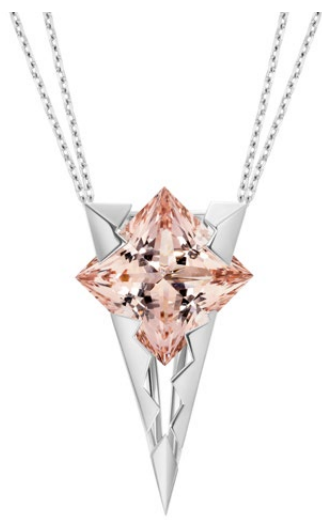
Capture In Colors pendant Material: 18 carats white gold - 14,26 g Stones: morganite - 11,94 ct Chain: white gold double 65 - 70 cm