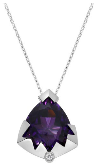
Capture In Colors pendant Material: 18 carats white gold - 7 g Stones: amethyst - 5,88 ct / diamond- 0,03 ct Chain: white gold 45 - 50 cm