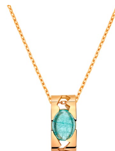
Capture In Colors pendant Material: rose gold 18 carats - 6,02 g Stones: tourmaline paraiba - 1,5 ct Chain: rose gold 45 - 50 cm