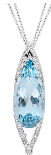
Capture In Colors pendant Material: 18 carats white gold - 17,81 g Stones: aquamarine - 23,11 ct / diamonds - 0,44 ct Chain: white gold double 65 - 70 cm