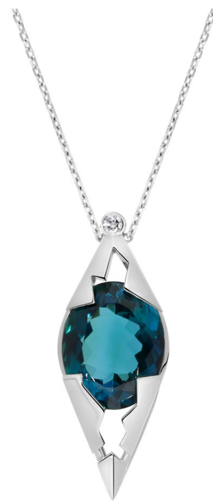
Capture In Colors pendant Material: 18 carats white gold - 5,58 g Stones: umba saphir - 4,62 ct / diamond - 0,03 ct Chain: white gold 45 - 50 cm

For this capsule collection, these jewelry pieces feature an incredible colored gemstone at their center, Amethyst, Aquamarine, Tourmaline, Tanzanite, Morganite, protected by the Capture setting.