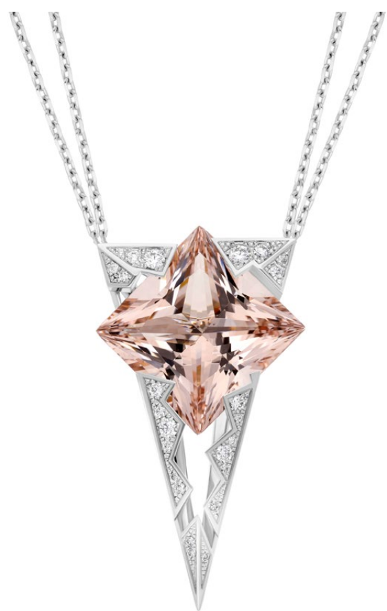
Capture In Colors pendant Material: 18 carats white gold - 14,03 g Stones: morganite - 11,94 ct / diamonds - 0,23 ct Chain: white gold double 65 - 70 c

Caroline Gaspard's passion for fine stones was born from her many travels across different continents. Each stone, for which she had a special fondness, is a precious memory of these moments of discovery, starting with the very first stone she acquired, a red, diamond-shaped tourmaline.