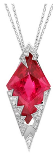
Capture In Colors pendant Material: 18 carats white gold - 17,6 g Stones: red tourmaline - 18,8 ct / diamonds - 0,35 ct Chain: white gold double 65 - 70 cm