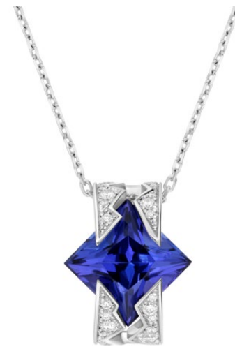
Capture In Colors pendant Material: 18 carats white gold - 7,06 g Stones: tanzanite - 3,92 ct / diamonds - 0,63 ct Chain: white gold 45 - 50 cm