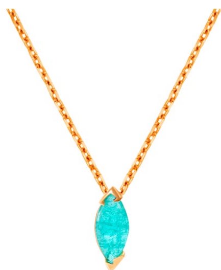
Capture In Colors pendant Material: rose gold - 3,61 g Stones: tourmaline paraiba - 0,95 ct Chain: rose gold 45 - 50 cm