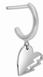
Lovetag earring 18 carats white gold 690 €

Say goodbye to Cupid's arrow! The unexpected thunderbolt upends romantic clichés : the hearts and rectangles pierced with the elemental motif, pulsating with 10,000 volts, embody the brand's bold free spirit.