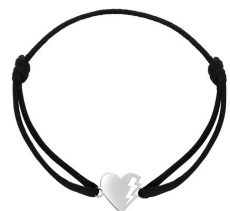
Lovetag bracelet 18 carats white gold 550 €