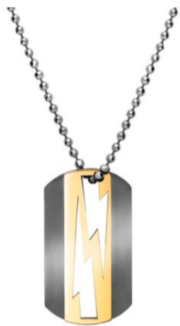
Lovetag pendant 18 carats yellow gold, titanium 1 490 €