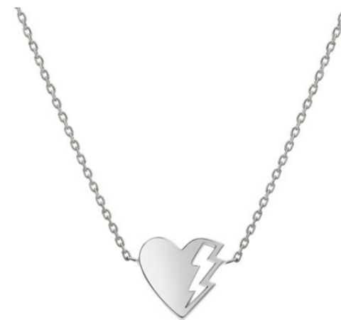
Lovetag necklace 18 carats white gold 1 550 €