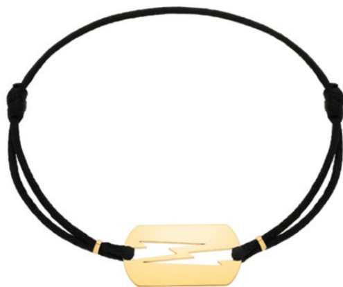
Lovetag bracelet 18 carats yellow gold 790 €