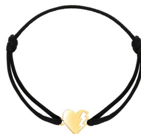
Lovetag bracelet 18 carats yellow gold 490 €

Perfect gifts to express love, passion or fondness, each piece symbolizes the close bond of people who vibe together . Romantic or platonic, Lovetag is for all types of love: inseparable alter egos or big family tribes.