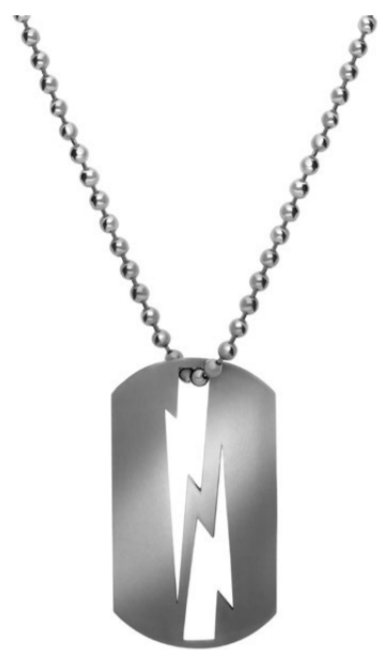
Lovetag pendant titanium 990 €