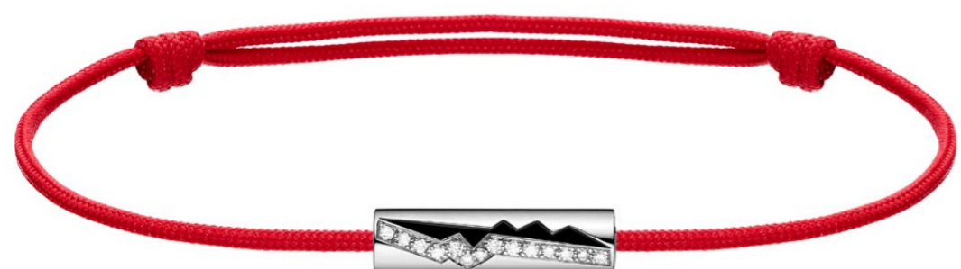
Bracelet Capture Amulet Or blanc 18 cts, diamants 0,08 cts

A new challenge for Akillis is the use of Akoya pearls. Known for their exceptional luster and perfectly smooth surface, these pearls offer a subtle shine and natural beauty, making them the perfect symbol of pure and unconditional love. In this new variation, Akillis reinvents the pearl by integrating it into mixed creations, where each jewel tells a unique love story.