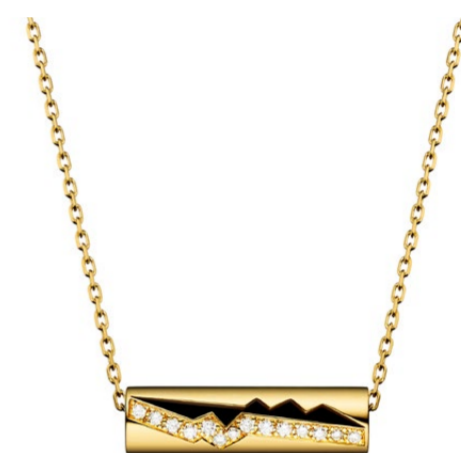
Pendentif Capture Amulet Or jaune 18 cts, diamants 0,08 cts

These jewels are available in gold, titanium, and diamonds, the emblematic materials of the French jewelry brand. Gold, a symbol of eternity and purity, is perfectly suited to these exceptional creations, while titanium, known for its strength and lightness, adds a contemporary touch. Diamonds, on the other hand, enhance each piece with an incomparable flash of brilliance.