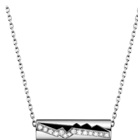
Pendentif Capture Amulet Or blanc 18 cts, diamants 0,08 cts

Here, the bracelets and necklaces of this new collection embody a harmonious alliance between tradition and modernity. Each piece is designed as a talisman, a protective jewel, for all men and women passionate about life.