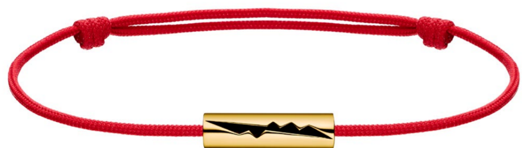
Bracelet Capture Amulet Or rose 18 cts